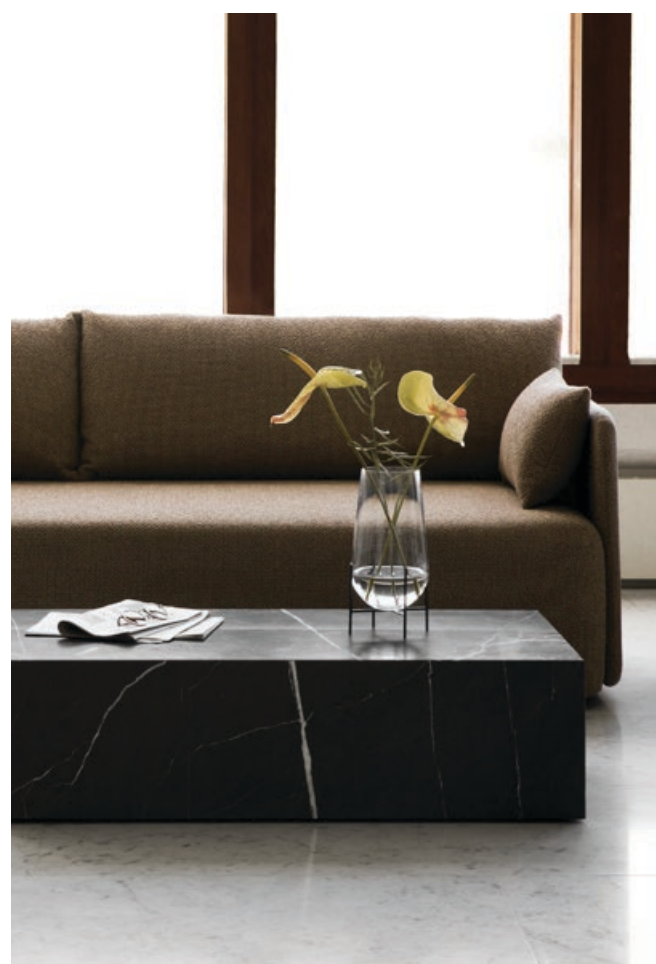
Offset Sofa, 3-seater, Colline 228, by Norm Architects Plinth Low, Grey Kendzo Marble, by Norm Architects Échasse Vase, Small, Clear Glass / Bronzed Brass, by Theresa Rand

One-, two- and three-seater sofas set on a wooden frame with down- and foam-filled upholstered cushions.