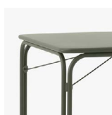
→ Bronze Green