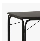
→ Warm Black