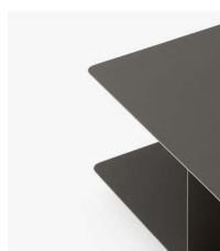
→ Stone Grey