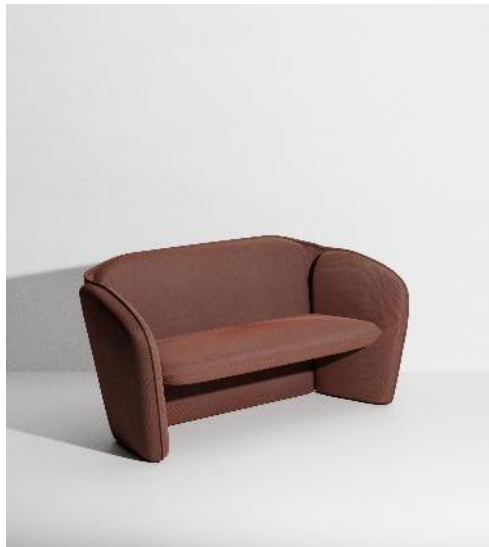
2 SEATER SOFA